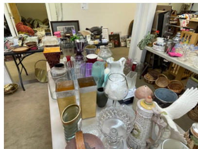
Views of the yard sale