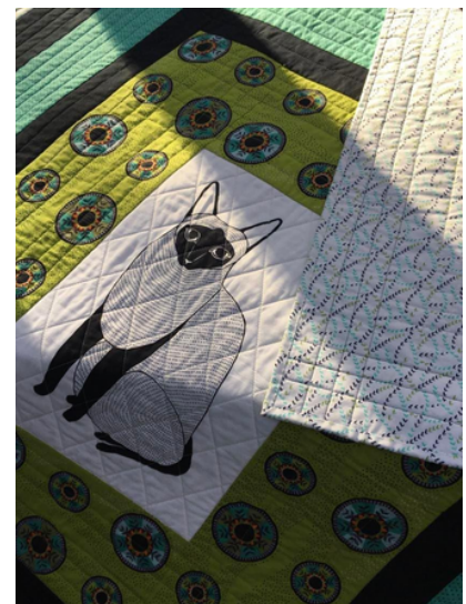
Quilt by itself