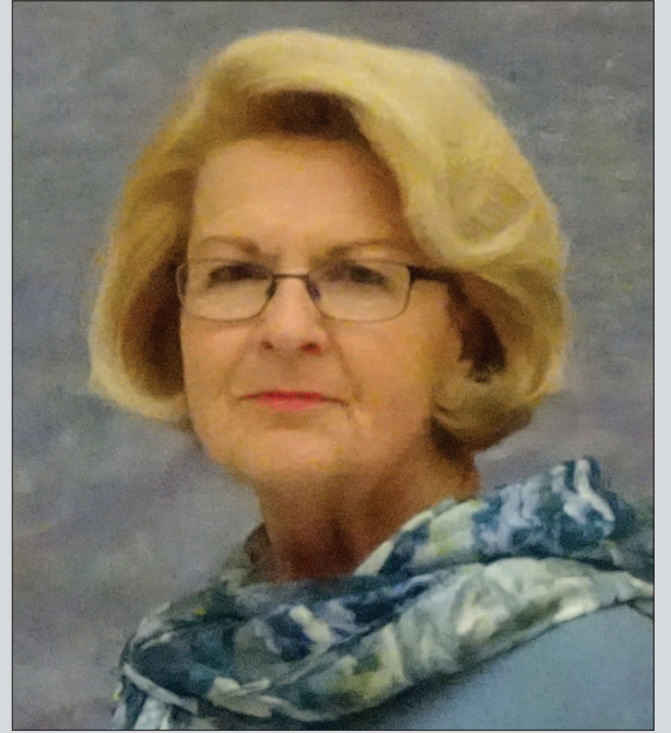
Humane Society of Wilkes what it is today. She will be missed by all those who knew her.