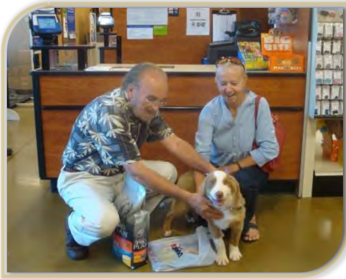
On Saturday, May 26 th , there were three adoptions at PetSmart, including "Dooley" (Plott Hound), "Sabrina" (cat), and "Leeza," the Aussie pup pictured above.