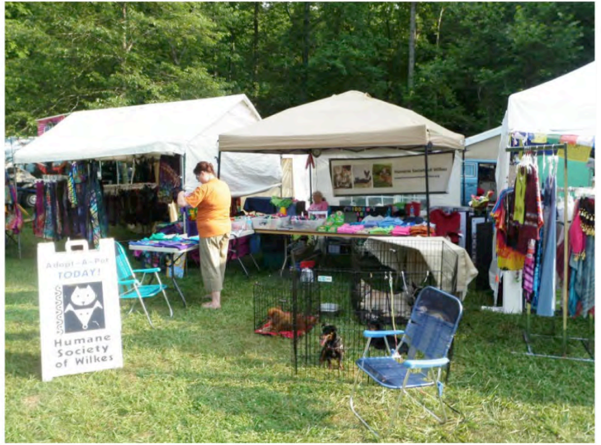
Our setup at the Mantra Bash last month - it was a beautiful weekend for an outdoor festival, and our volunteers and foster pets enjoyed mingling with festival goers.